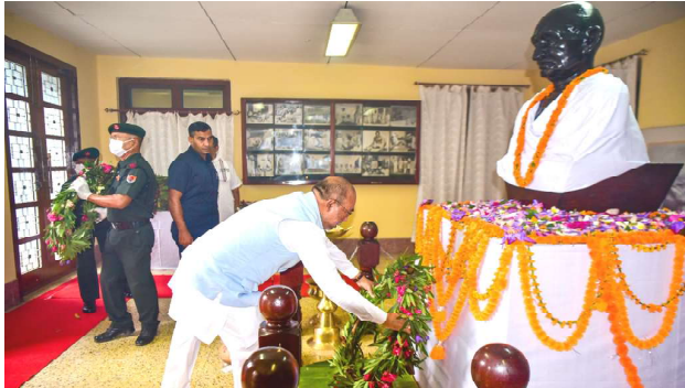
IT News Imphal, Oct 2:

Manipur observed the National Cleanliness Day paying homage to the Father of the Nation Mahatma Gandhi, today at the Gandhi Memorial Hall, Imphal. Chief Minister N. Biren Singh led others at a wreath laying ceremony at the statue of Mahatma Gandhi.