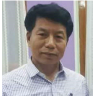
By: N. Munal Meitei

The country is facing with acute challenges in conservation of wildlife but still trying to protect the critical species and eco-regions from many challenges. The 6th Wildlife Week is celebrated across the country between 2nd to 8th October with an aim to arouse the general awakening of the people to protect and preserve the flora and fauna of the country and to take some critical steps since 1955.