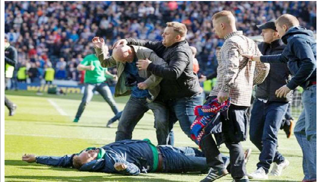
Agency Jakarta, Oct 2:

At least 174 people died at a football stadium in Indonesia and around 180 people were injured after fans invaded the pitch, triggering a stampede forcing cops to respond with tear gas. The toll was up from 127 earlier in the day.